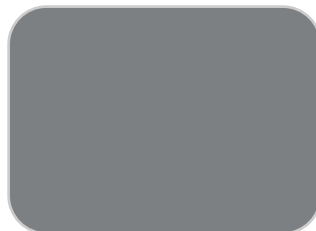
RAL 9023 [30.17] (5.22) (Pearl Dark Grey)