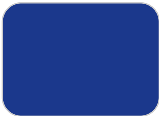
RAL 5002 [18.37] (1.48) (Smashing Blue)