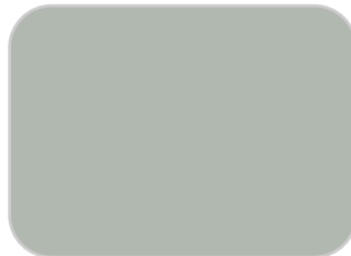
RAL 7038 [48.05] (1.61) (Ultimate Grey)